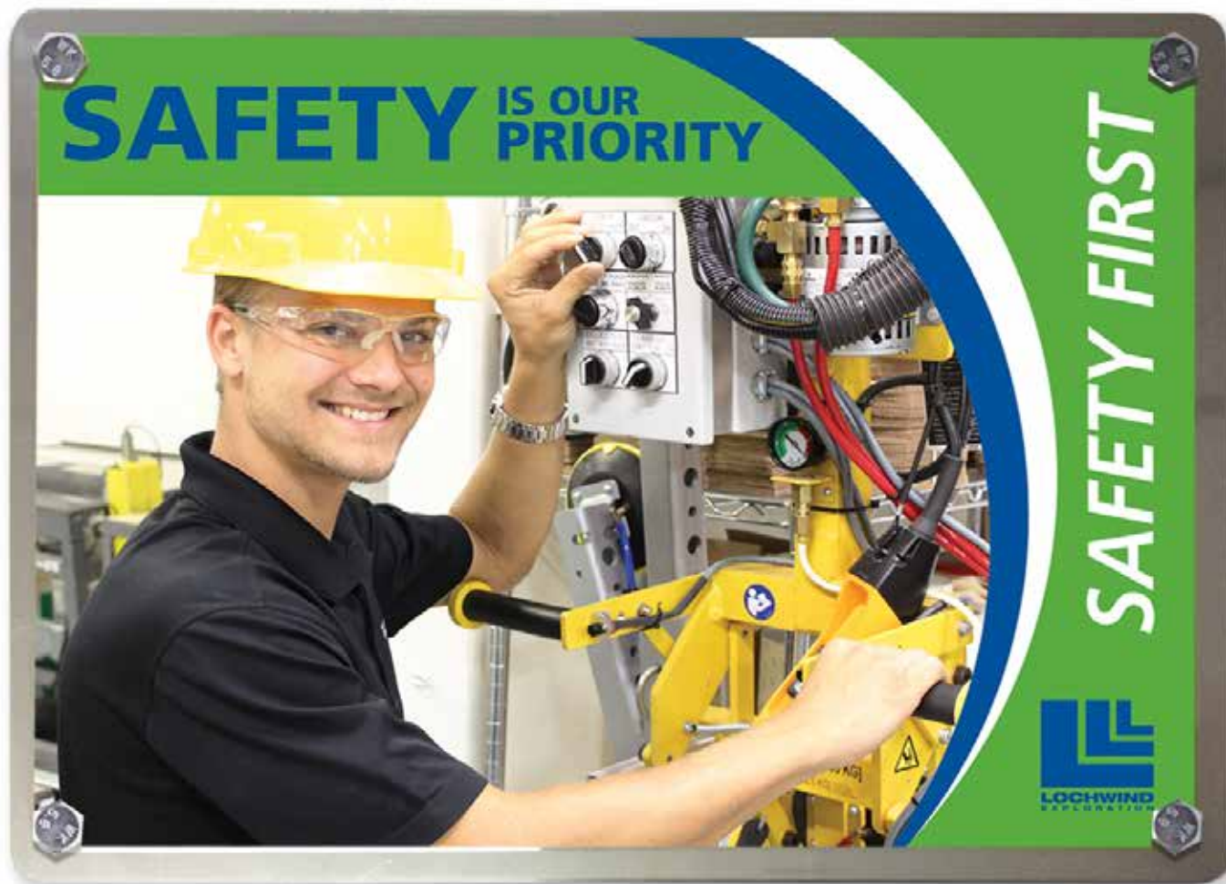
Stainless Steel Custom Signs - perfect for Food & Beverage Applications.