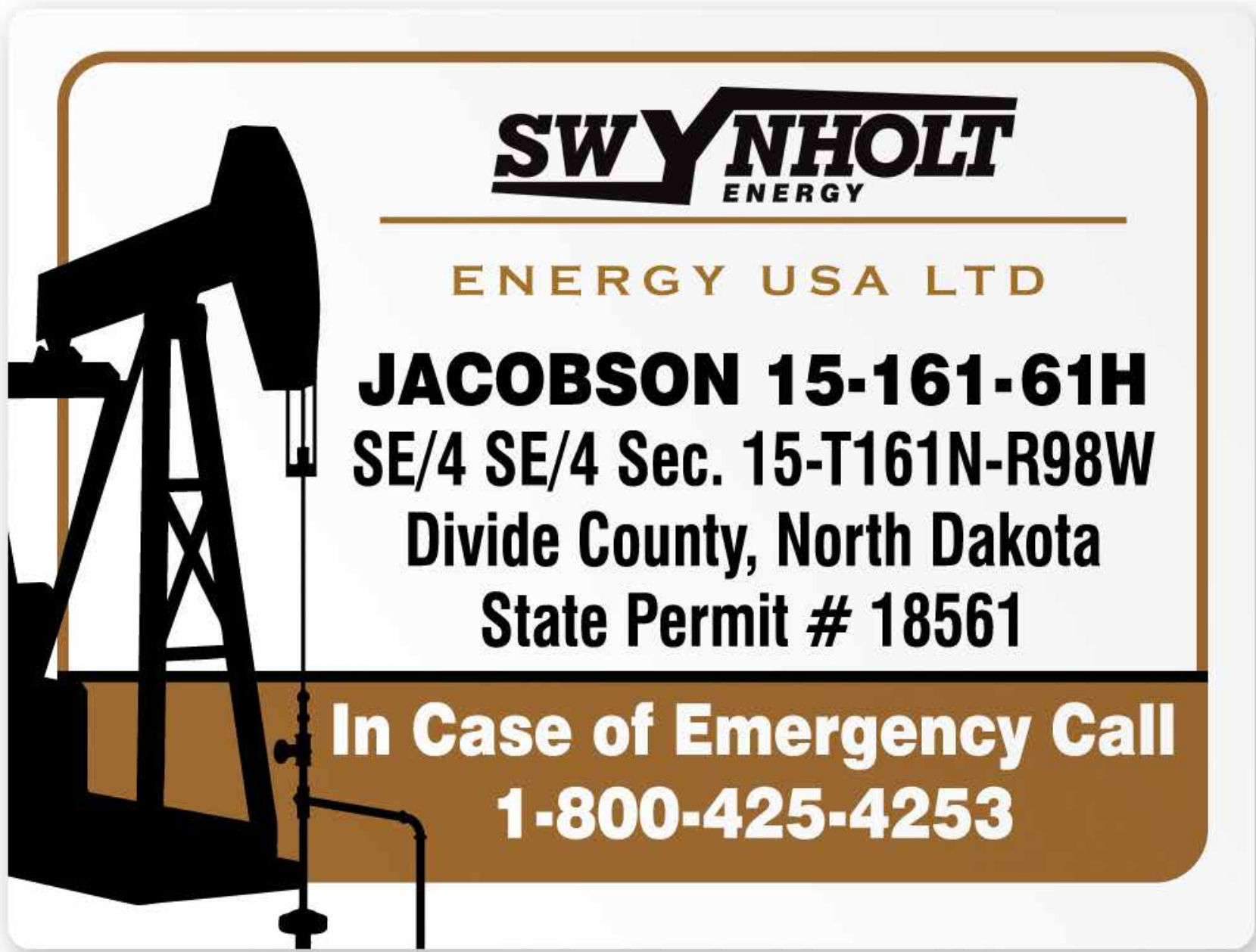
Custom Well-Lease signs for the Oil & Gas Industry.