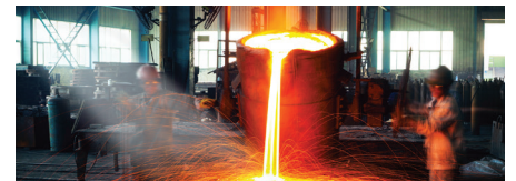
Tough, Rugged Conditions